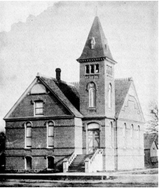
The 1896 building at Main and Holly

During worship June 8, you’ll get to hear a hymn popular at the time of our founding, played on a pump organ which was part of our early worship services. For the pot-luck meal following the single 10:30 a.m. service, folks will be asked to prepare casseroles or salads from recipes found in the 185-page Centennial Cookbook published in 1985, when this congregation celebrated its first century.