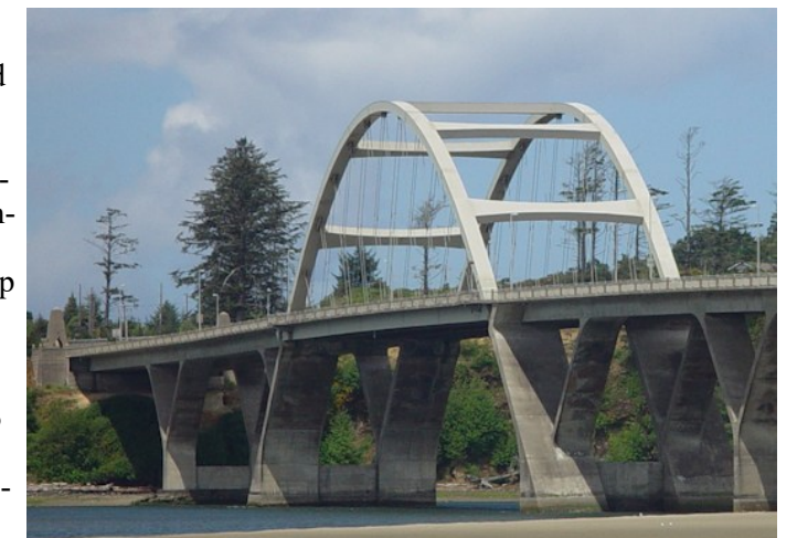
U.S. Highway 101 bridge over Alosea Bay, Waldport