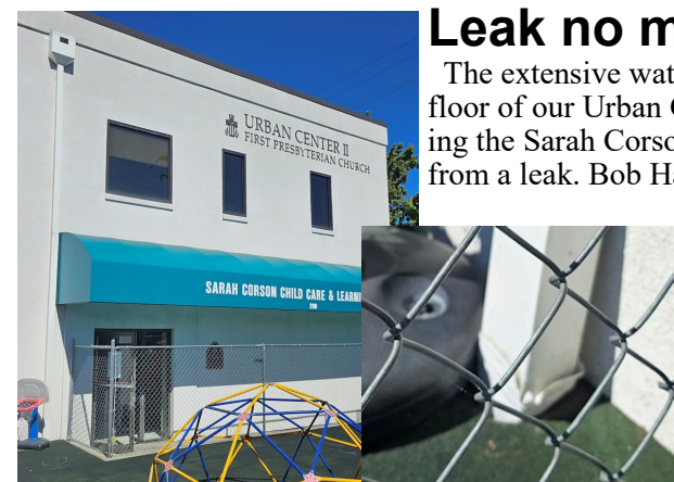
Stormwater from the downspout, blocked by a plugged subsurface drain, seeped through building walls. The contractor began repair and restoration work last week. We await an estimate of when the job will be complete.