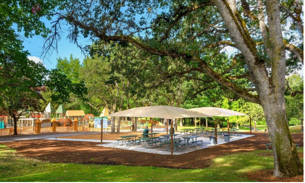
Bear Creek Park pavilion

to share. Bring your own beverage if pink lemonade doesn't suit your fancy. Table service will be provided.