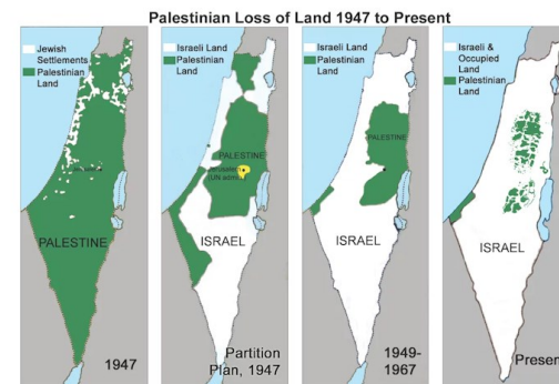
A series of maps documents shifts in control of land over 77 years.