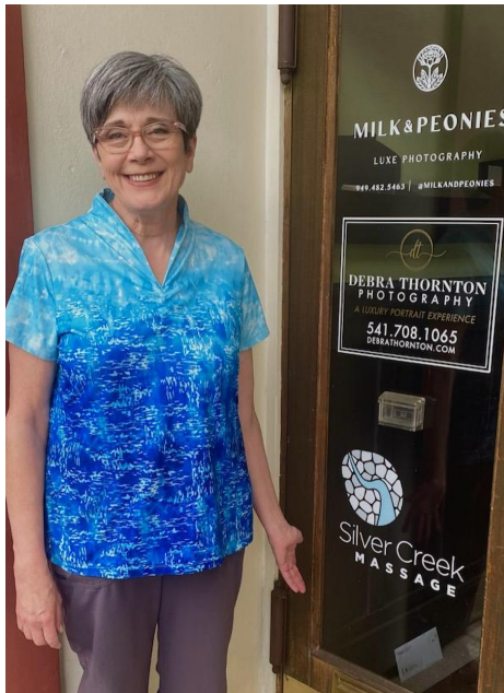
Silver Creek Massage on East Main Street