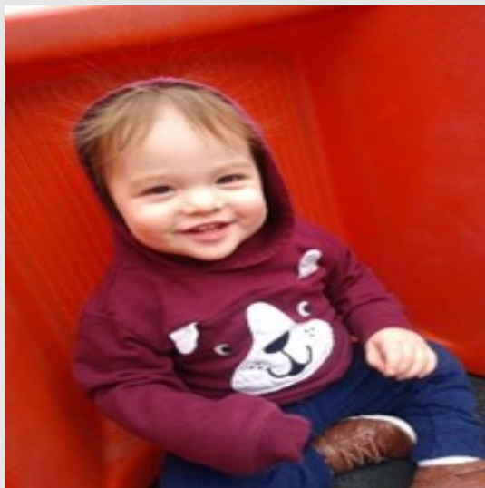
A toddler plays outdoors on a crisp fall day

We will be CLOSING EARLY , at 3:30 p.m. on Wednesday, November 25 . All children must be picked up no later than 3:30 p.m. We will be CLOSED Thursday, November 26 AND Friday, November 27 in observance of Thanksgiving.