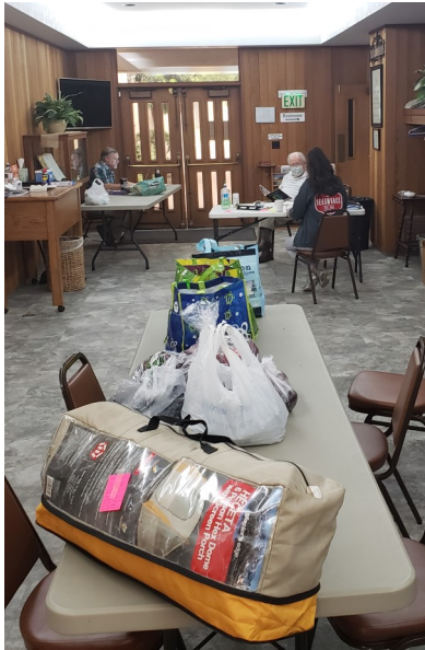
Donations kept coming in -

Was it easy? No, it wasn't. Communication was sketchy, expectations shifted, and precise scheduling was nonexistent. Outside our