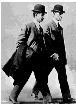
Orville and Wilbur, 1909

Our Book Nook April read is The Wright Brothers , a history by David McCullough.