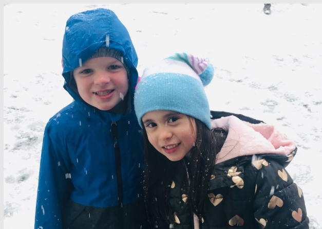
Two of our Pre-K children enjoy playing in the snow on our playground

Thank you one and all for participating in our Dr. Seuss Dress Up week in early March. We had a lot of fun and hope you did, too. We are looking into doing a "Pete the Cat" Dress Up week sometime this summer. Stay tuned!